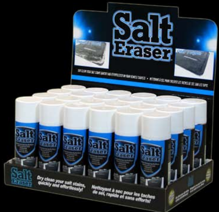
24 Pack Counter Display