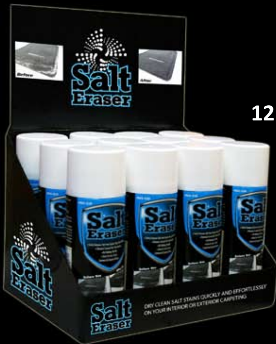
12 Pack Cut Case